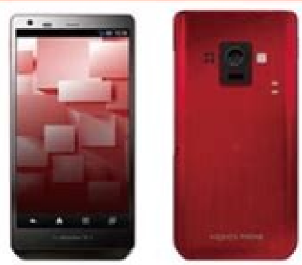
Fig. 1 Sharp-Aquos-Phone-Zeta-SH-02E

compound semiconductor, leading to upcoming displaying breakthroughs and life-changing user experiences. The IGZO technology is utilized to realize the next-generation display technology. It is developed by Sharp Corporation, who is the first to successfully mass-produce IGZO and bring to market. With the introduction in 2012 by Sharp, the technology is anticipated to enter the smartphone market which is the largest panel and affordable market for the new technology. With the technology, the mobile devices are considered to have more battery life and better visual quality. Therefore, the IGZO is believed to be the other important technology besides the current mainstream Low Temperature Poly-Silicon (LTPS) and amorphous silicon (a-Si) technology for the small-sized panels. Though the LTPS backplane can support up to 300 ppi of resolution, but it also has its limitation like size restriction to small and medium sizes only. The IGZO technology seems to be the most ideal solution to the next-generation display because of its flexibility in both size and form factor.